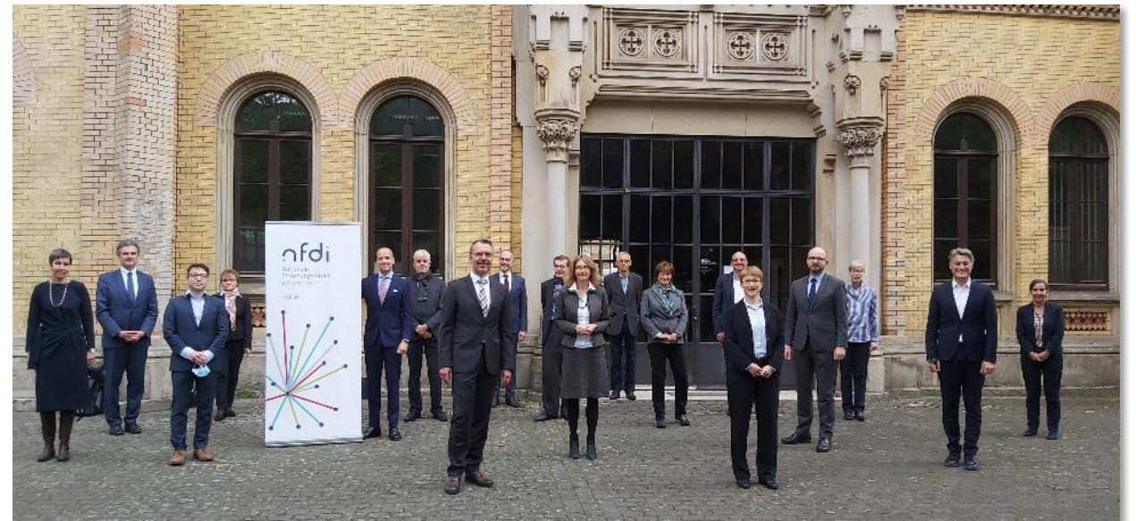
Founding assembly on October 12th, 2020